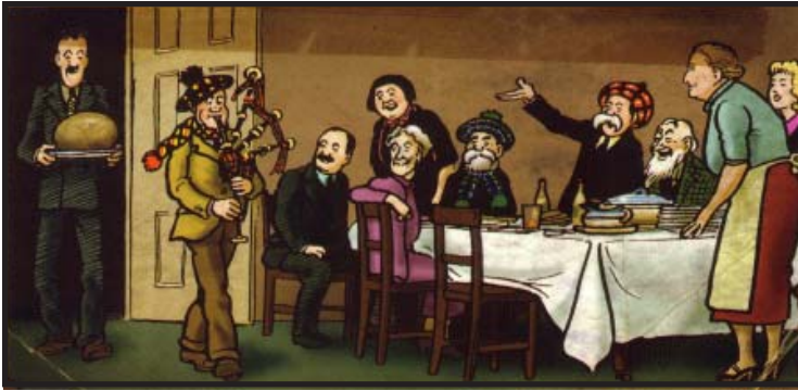
from “The Broons Burns Night” publication, D.C. Thomson & Co., Ltd.