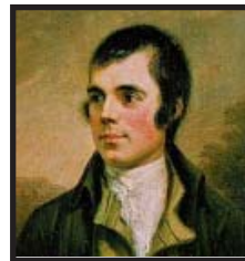
The most famous portrait is the one used for our program cover.