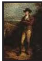
The last we will look at is known to have been painted by Alexander Nasmyth in 1787 when Robert was 28.